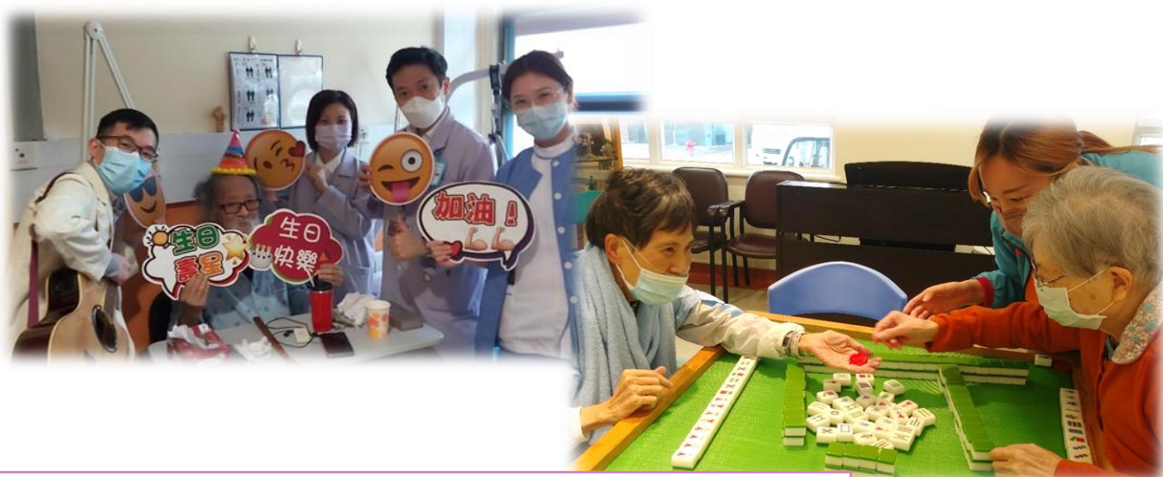
「慈惠寧養病床計劃」及「夾心階層寧養病床計劃」院友參加不同活動 RCS & SCB patients joining various activities

Despite many difficulties, we have served 49 and 9 patients and their families under RCS Beds & SCB Programmes respectively, during 2022. Here are two touching stories from our patients: