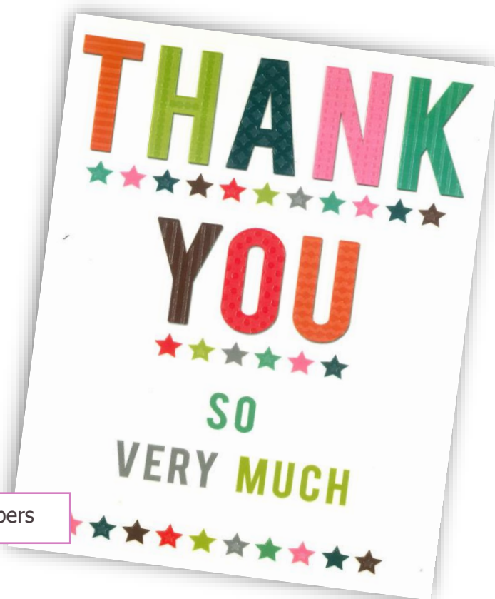
Appreciation card from family members

The donation was great encouragement for the staff at the Holistic Care Centre. It also testified the beauty of "Respecting life, Impacting life."